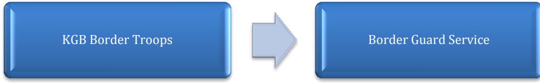
Figure: 1 Russian Organizational Change after the end of the Cold War